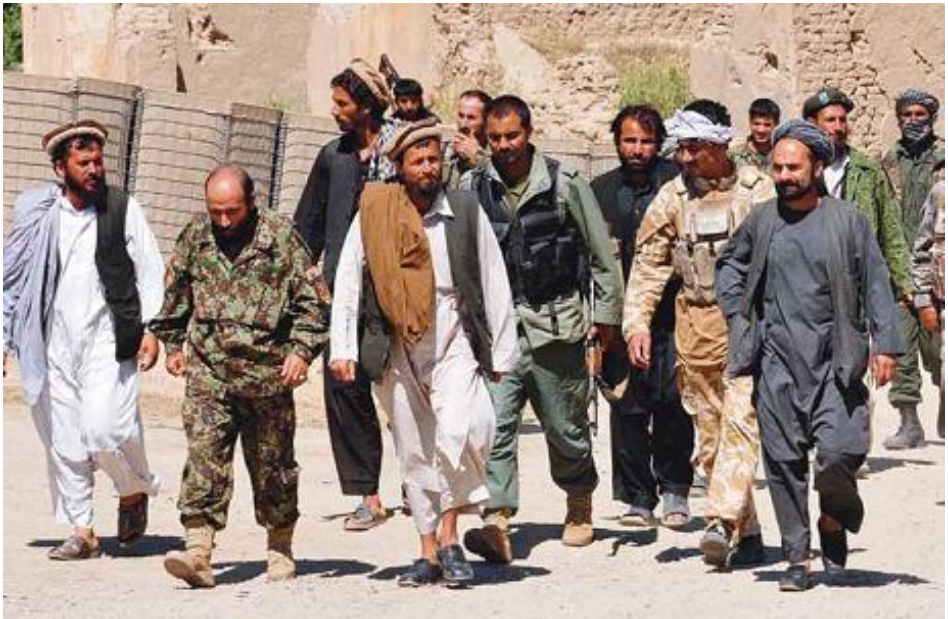
Taliban joining the peace process in Puza-i-Eshan