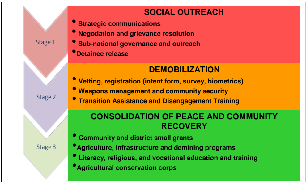
APRP Program Structure

The APRP seeks to bring former fighters back to their communities with honor and dignity, so they can live peaceful, healthy, and productive lives. Reintegration is enabled by local agreements where communities (supported by the Government) reach out to insurgents, work to resolve their grievances, and encourage them to stop fighting and rejoin their communities peacefully and permanently. The APRP has three stages: Social Outreach, Demobilization, and Consolidation of Peace and Community Recovery.