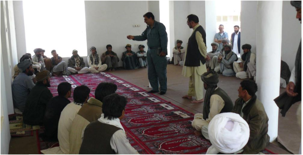
Registering Reintegration Candidates in Badghis