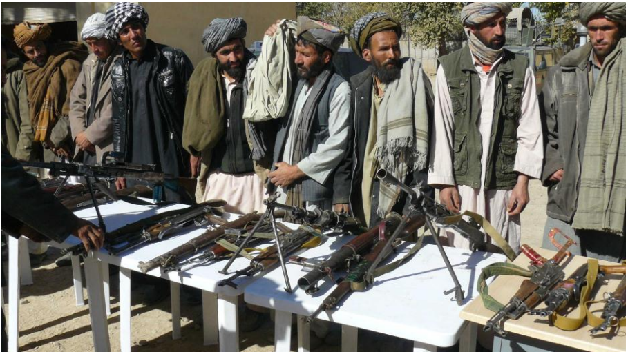
Reintegration Candidates undergoing weapons management

How does APRP handle insurgents who wish to flip sides and fight on behalf of the government? APRP is not a means for establishing pro-government militia groups. Groups that change sides should not join APRP until they are ready to leave the conflict and reintegrate with their communities. Insurgents who reconcile and wish to join the Afghan National Security Forces, (as National Army, National Police or Local Police,) can and should reintegrate first, so they can be properly vetted, demobilized and granted forgiveness for their anti-government activities.