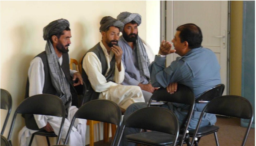
Reintegration candidates being briefed on demobilization

International Development Agencies and PRTs: Donor nations may seek to utilize their existing programs to support reintegrees and their communities. Reintegrees have already been included in existing vocational and educational programs, as well as community demining. As with APRP activities it is important that donor activities are not targeted at reintegrees alone but also inclusive of their communities.