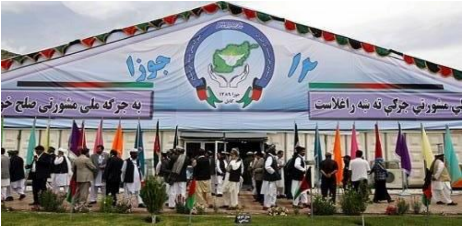
National Consultative Peace Jirqa