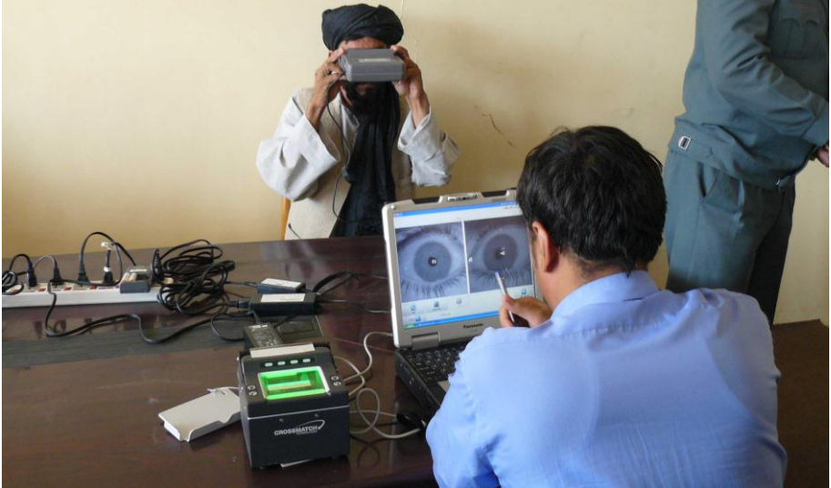
Biometric data is taken from a reintegree

National funding sources will be available to some troops and PRTs. International development agencies (USAID, DFID, AUSAID, etc.) and NGOs also have development programs which can support reintegration. Provinces can partner with the private sector to train and employ reintegrees. All of these activities should be coordinated by provincial authorities.