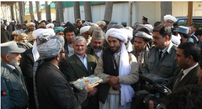
Provincial governor presents Qur'an to reintegration candidates

The prospects for peace during a conflict often improve when the combatants have determined that they find that they cannot defeat the enemy through force, and they see a future of endless hard, inconclusive combat, draining their will and that of their allies. Such sentiments are increasingly evident in Afghanistan. These conditions improve the likelihood of widespread reintegration of combatants.